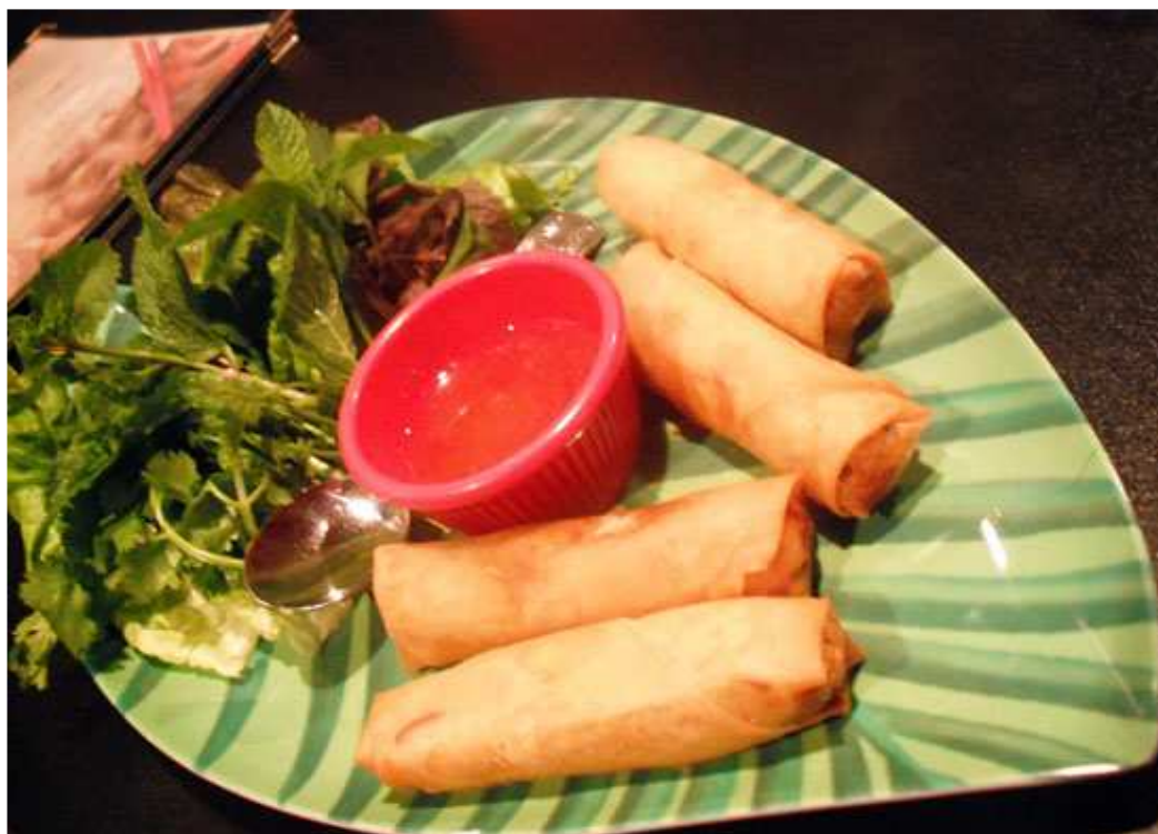
Tottie claims her rolls are the best.