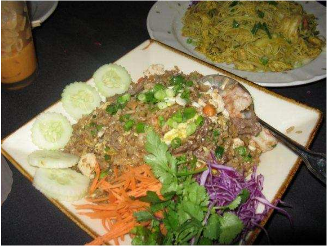
Shrimp, chicken and beef in this rice!

At this party I was introduced to the “Tottie Roll” ($7.50) which are crispylicious spring rolls that you put inside a lettuce leaf along with fresh mint, cilantro and some fish sauce.