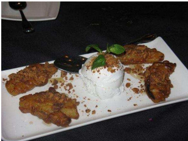
Mmm honey fried bananas w/coconut ice cream

Those honey fried bananas are out of control amazing good!! My second favorite is the pumpkin cheesecake made from small green kamancha pumpkins. The cheesecake has little bursts of the pumpkin puree inside and it is just very honest and pure in flavor.