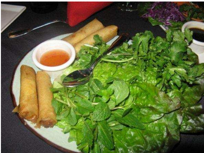
Must have Tottie rolls