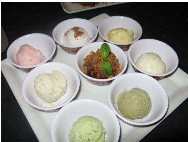
No pain from this non dairy ice cream, YUM!!

This article is clearly getting long, and I could post pictures and descriptions all night from Tottie's. I just think you need to go and see for yourselves folks!! Tottie's Asian 2 most undoubtedly gets the FOOD-TRAMP-STAMP OF APPROVAL!!